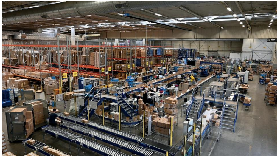
Speed and flexibility are called for in Eurapon's logistics centre

Investing in case processing. In view of rising order volumes, Eurapon had to increase the performance of the two processing lines. The semi-automatic case processing systems at the beginning and towards the end of the lines were the obvious places to start. Both the erection and the sealing of the cases had to be done much faster. A call for tenders led to contact with Lantech, a packaging machine manufacturer with extensive expertise in the field of